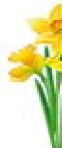
DAFFODIL rebirth new beginning