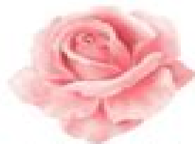
PINK ROSE perfect happiness