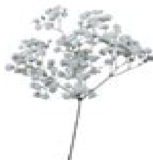
BABY'S BREATH everlasting love