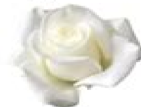
WHITE ROSE innocence new beginnings