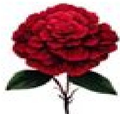
RED CARNATION deep love