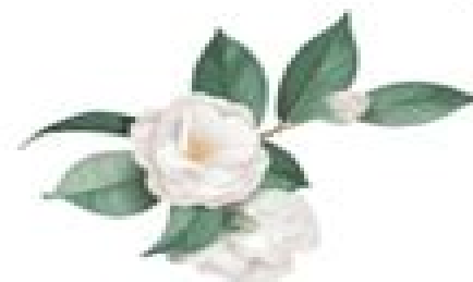
CAMELLIA self-reflection inner strength