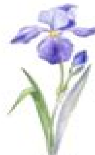
IRIS good news