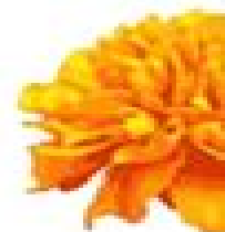
MARIGOLD "Mary's garden"