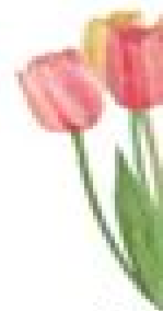
TULIP declaration of love