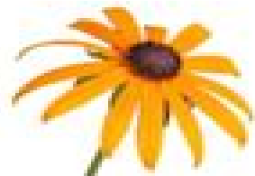
BLACK EYED SUSAN justice