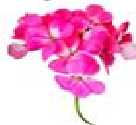
GERANIUM true friendship preference