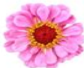
ZINNIA thoughts of absent friends