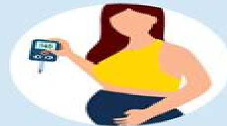
Pregnancy-related health conditions.