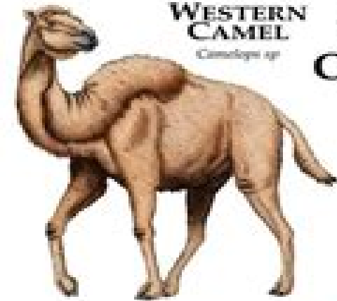
WESTERN CAMEL Camelops sp.