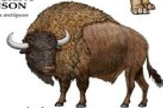
ANCIENT BISON Bison antiquus