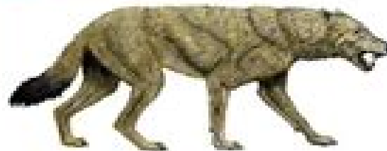
DIRE WOLF Canis dirus