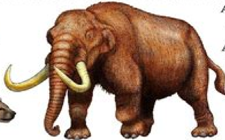
MASTODON Mammot americanum