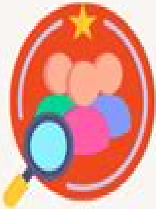
Talent Management Strategy