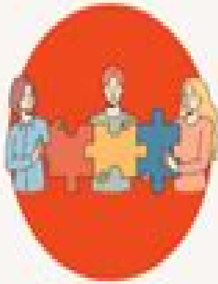
Employee Engagement & Retention Strategy