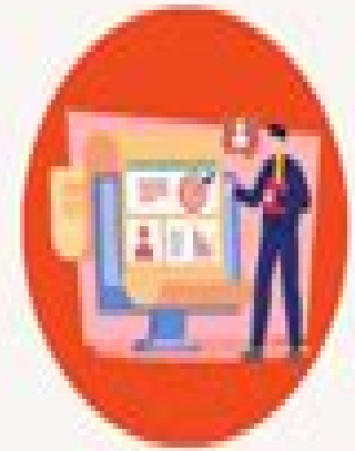
Workforce Planning Strategy