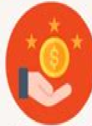
Compensation & Rewards Strategy