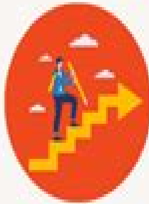
Employee Development Strategy