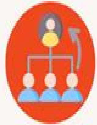
Succession Planning Strategy