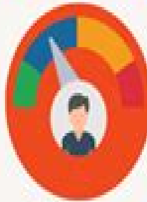
Performance Management Strategy