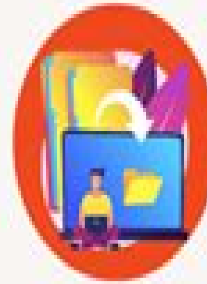
HR Digital Transformation Strategy