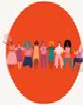
Diversity & Inclusion Strategy