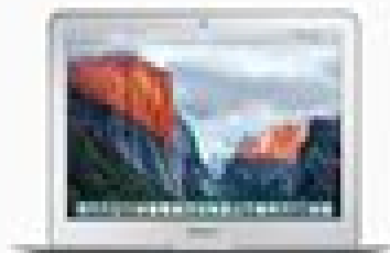
MacBook Air 11-inch from $899