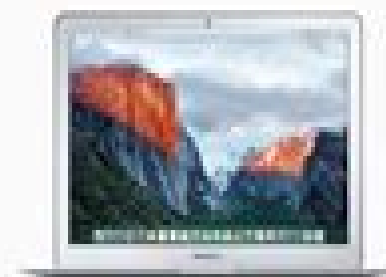
MacBook Air 13-inch from $999