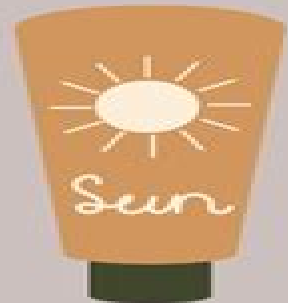
go out for fresh air