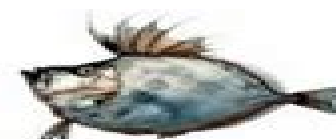
Pez de San Pedro