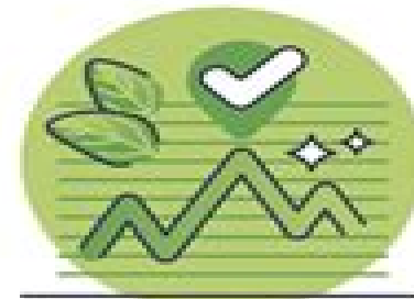
PLAN ACCORDING TO TRESHOLDS