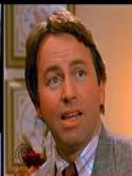
John Ritter 1948 – 2003