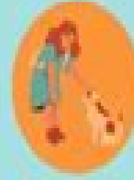
Spending Time With Pet & Animals