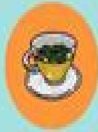
Drinking Herbal Tea