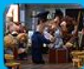
Postman Pat Misses the Show