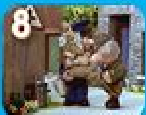
Postman Pat Has Too Many Parcels