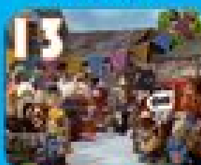
Postman Pat and the Mystery Tour