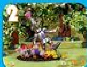
Postman Pat and the Suit of Armour