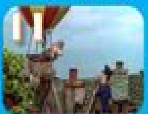
Postman Pat Takes Flight