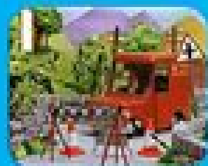
Postman Pat and the Hole in the Road