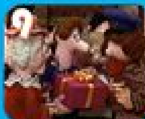
Postman Pat and the Big Surprise