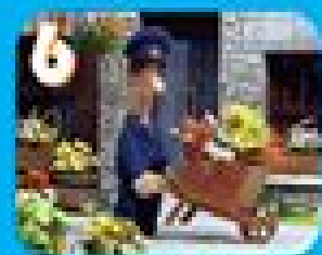
Postman Pat Has the Best Village