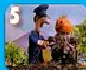
Postman Pat Follows a Trail