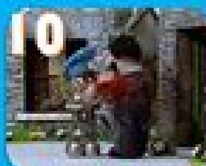
Postman Pat and the Robot