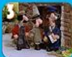
Postman Pat in a Muddle