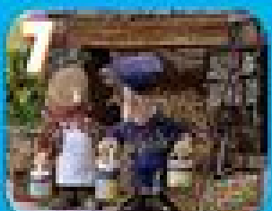
Postman Pat Paints the Ceiling