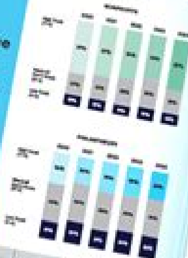
FIGURE 10: PUBLIC TRUST IN NONPROFITS AND POLYCAPITALISM VS. OTHER IDEOLOGIES, 2010-2024