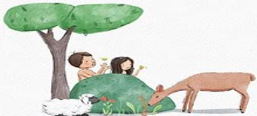
DAY 6: LAND ANIMALS & HUMANS