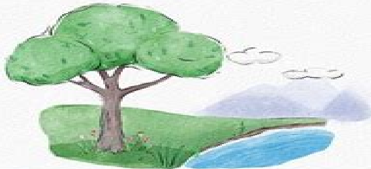
DAY 3: LAND, SEAS, PLANTS & TREES