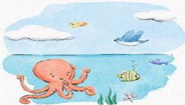
DAY 5: BIRDS & SEA LIFE