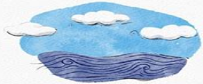
DAY 2: SKY