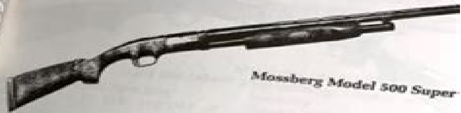
Mossberg Model 500 Super

Mossberg Model 500 Security & Persuader ATPB Similar to the Model 500 field law enforcement use; 12 gauge, 6- shot, 18 1/2" barrel; add 17% for parkerized finish; add 9% for rifle sights; add 26% for nickel finish; add 13% for "Speedfeed" stock; add 22% for camo finish Estimated Value: $150.00 - $275.00