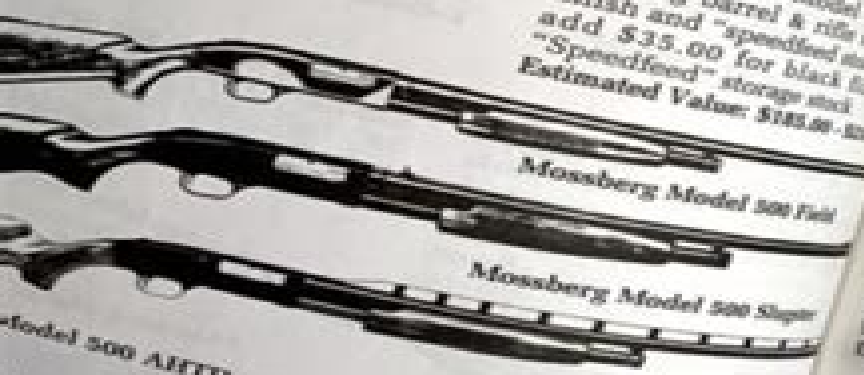
Mossberg Model 500 Field

Mossberg Model 3000 Field Gauge: 12 or 20; regular or magnum Action: Slide action; hammerless; repeating Magazine: 4-shot tubular, 3-shot in barrel; 26" improved cylinder, 28" modified or full, 30" full; ventilated rib; "Multi-choke" optional; add 10% for "Multi-choke" Finish: Checkered walnut pistol grip & slide handle Estimated Value: $200.00 - $265.00