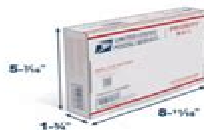
Small Flat Rate Box