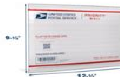
Small Flat Rate Envelope