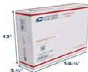
Medium Box - 2 (side-loading)