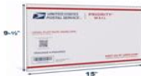
Legal Flat Rate Envelope