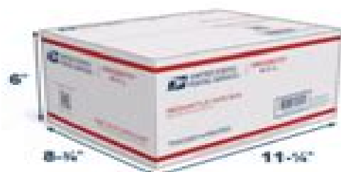
Medium Box - 1 (top-loading)