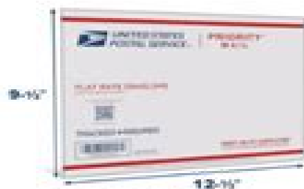
Flat Rate Envelope