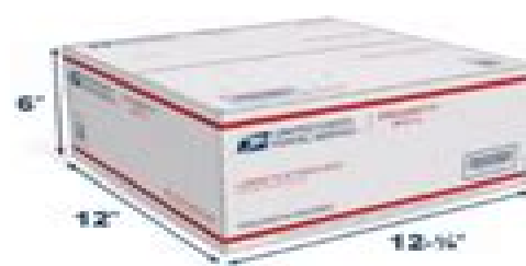
Large Flat Rate Box