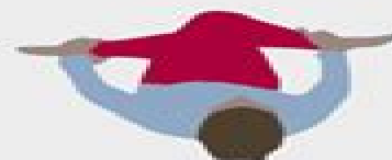
RECLINING COW FACE