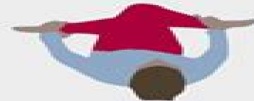
RECLINING COW FACE