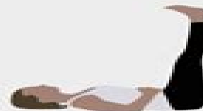
LEGS UP THE WALL