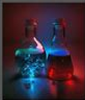
color change chemiluminescence