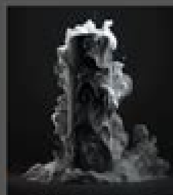
sugar and sulfuric acid