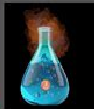
copper and nitric acid