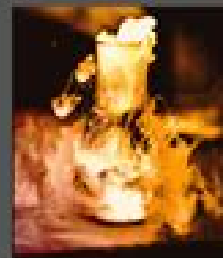
sodium in water