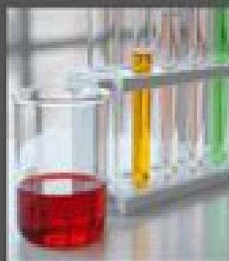
traffic light reaction