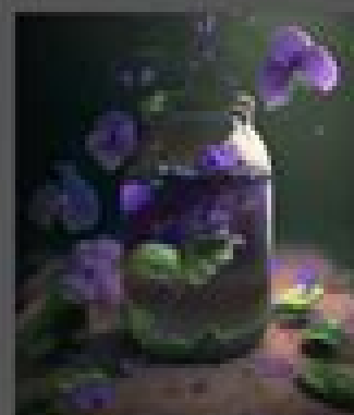
flower shop reaction