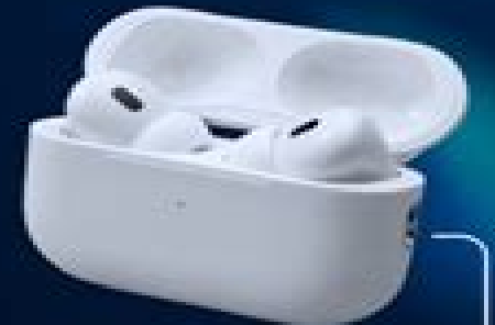
Pro 2nd Gen