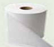
Paper Towels and Napkins (Kitchen Only)