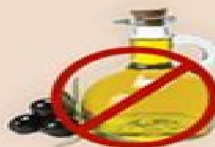
Oil or Grease