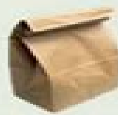
Uncoated Paper Bags