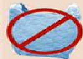
Plastic Bags or Wrappers