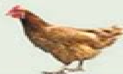
Meat, Seafood Bones