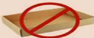
Plastic Coated Cardboard