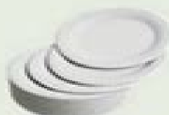
Uncoated Paper Plates