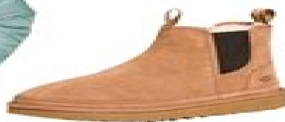
15. CHELSEA BOOTS