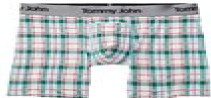
10. BOXER BRIEFS