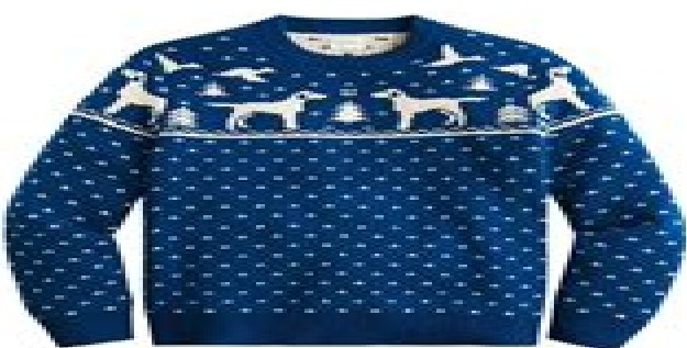
1. CREWNECK SWEATER