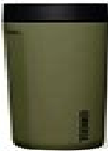
2. COMMUTER CUP