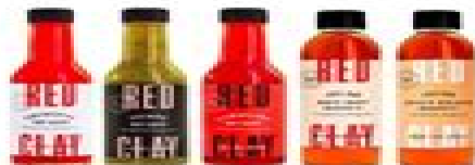
5. HOT SAUCE SET