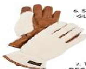
6. SHERPA GLOVES