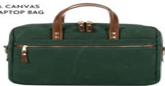
8. CANVAS LAPTOP BAG