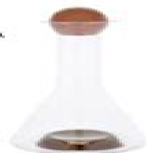
7. TANK DECANTER