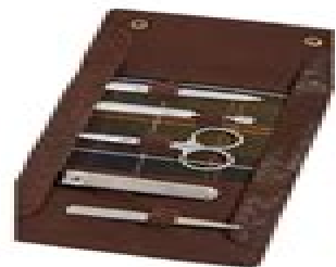
3. MANICURE SET