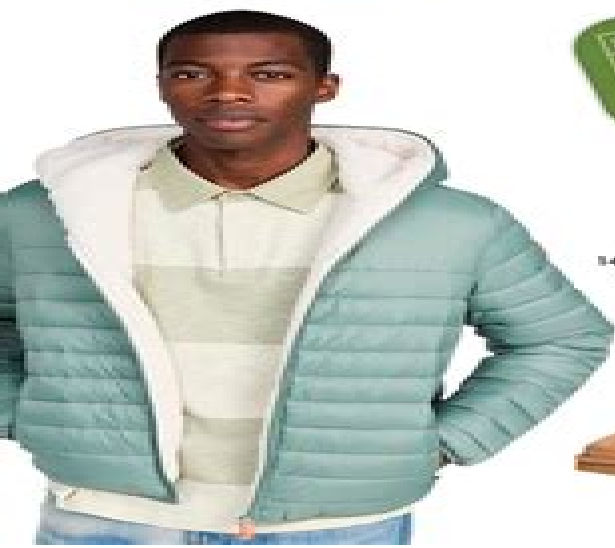
14. HOODED JACKET