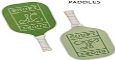
12. PICKLEBALL PADDLES