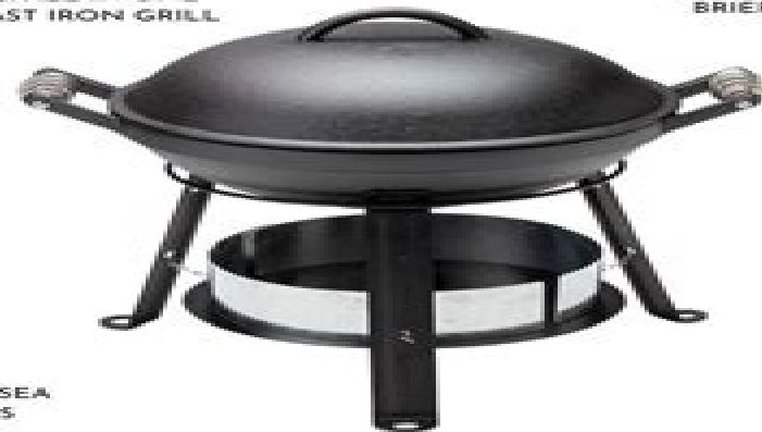
13. ALL-IN-ONE CAST IRON GRILL