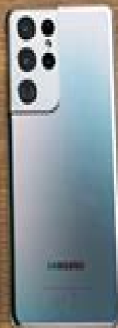
Galaxy S21 Ultra