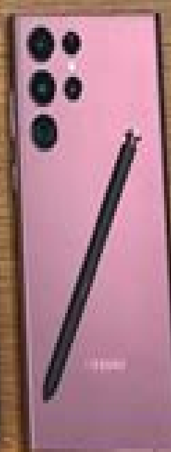
Galaxy S22 Ultra