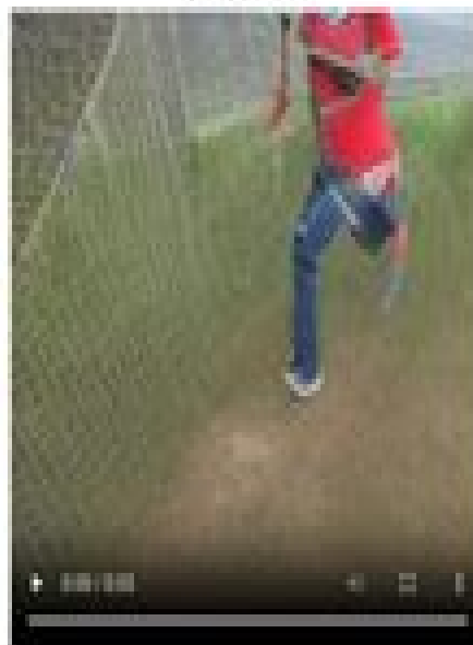
Beautiful vampire woman with ...