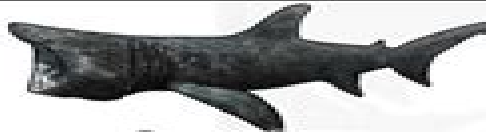
BASKING SHARK Cetorhinus maximus