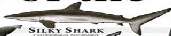
SILKY SHARK Carcharias filiformis