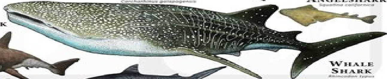
WHALE SHARK Balaenodon typus