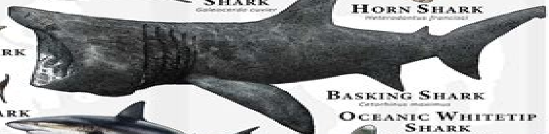
BASKING SHARK Cetorhinus maximus