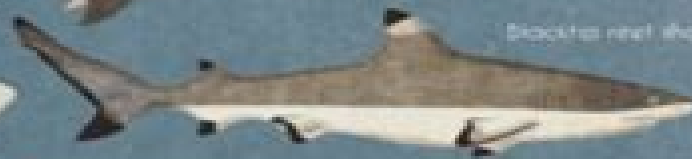
Blacktip reef shark