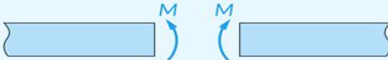
Positive internal moment