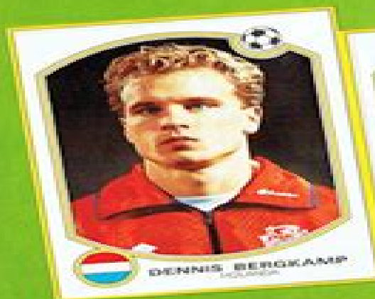
DENNIS BERGKAMP Amsterdão