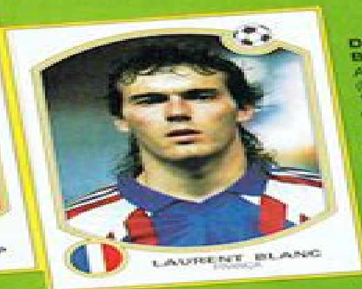
LAURENT BLANC Paris