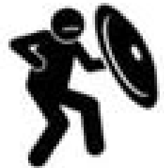
Always on Guard