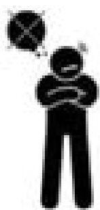
Avoid Thinking of the Trauma