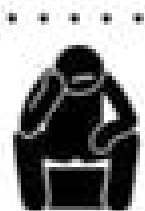
Loss of Interest