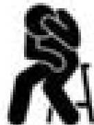
Feeling Guilt or Shame