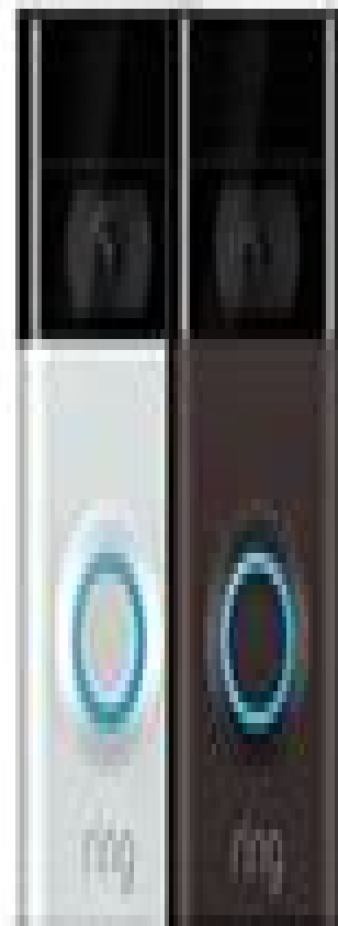
Ring Video Doorbell 2