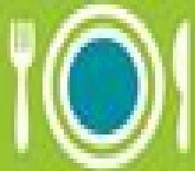
Normal food intake

Science is showing both intermittent fasting and traditional dieting can lead to healthy weight loss