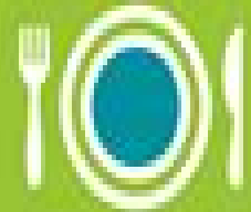
Normal food intake

Science is showing both intermittent fasting and traditional dieting can lead to healthy weight loss