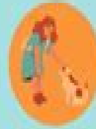
Spending Time With Pet & Animals