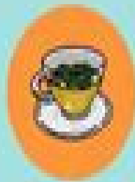
Drinking Herbal Tea