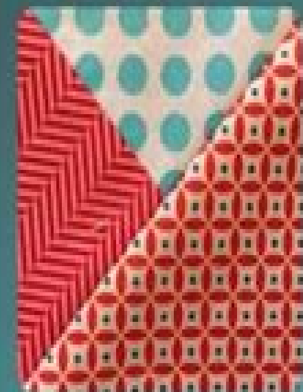
3 QUARTER SQUARE TRIANGLES