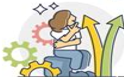
DECISION MAKING AND MOTOR CONTROL