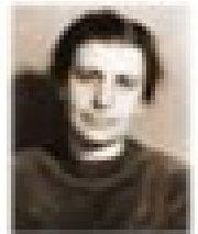
Anna Freud Child Analysis

Freud's Structural Model; Psychosexual Stages