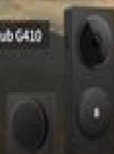
Presence Sensor FP300