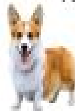
Pembroke Welsh Corgi