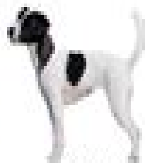
Parson Russell Terrier