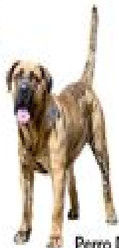
Perro De Presa Canario