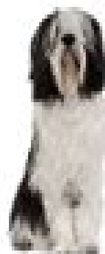
Polish Lowland Sheepdog