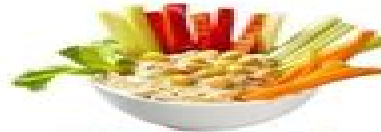
Hummus & Veggies