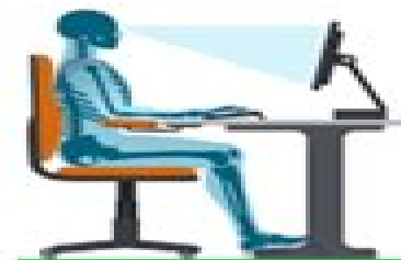
✅ CORRECT SITTING POSTURE