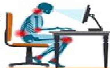
❌ WRONG SITTING POSTURE