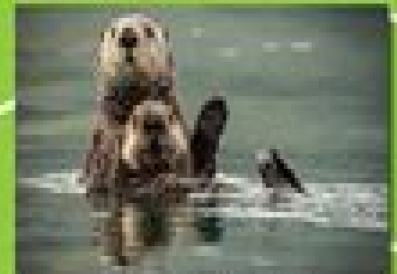
MALE SEA OTTERS