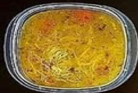
Bone Broth chicken soup