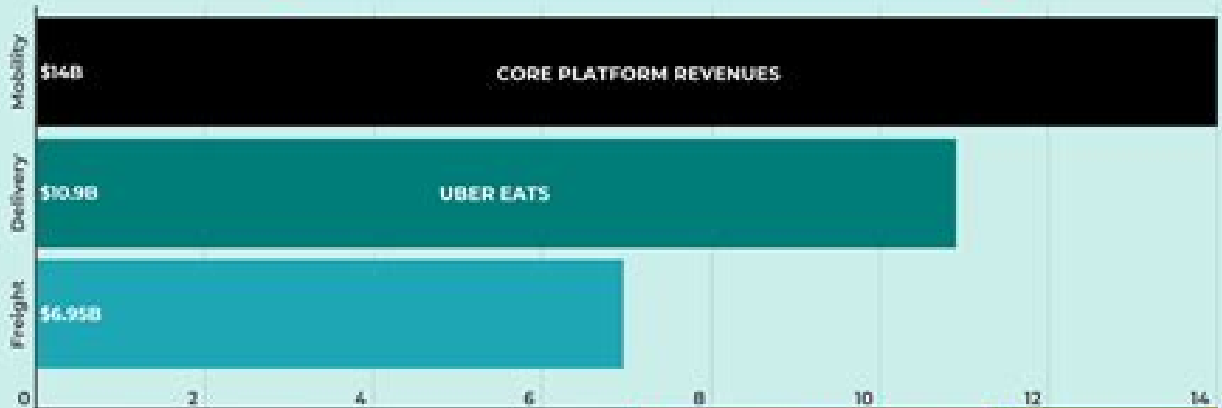
Revenue Per Segment