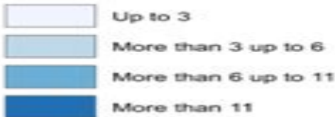
Map D: New build housing - Housing Association Sector completions: rates per 10,000 population, year to end September 2022