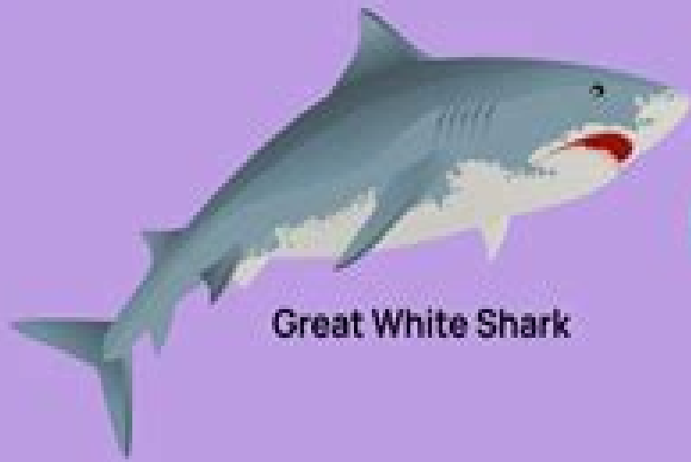
Great White Shark