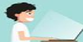
90.99% Computer Vision