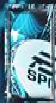
HUT NHL PLAYER PACK

PRE-ORDER EA SPORTS™ NHL™ 25 STANDARD EDITION AND RECEIVE: