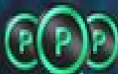
500 NHL POINTS