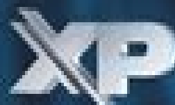
WHL BATTLE PASS XP BOOST (X2)