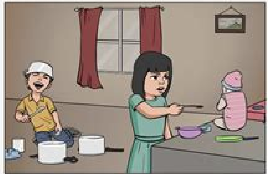
Pre-Operational Stage (ages 2-7)