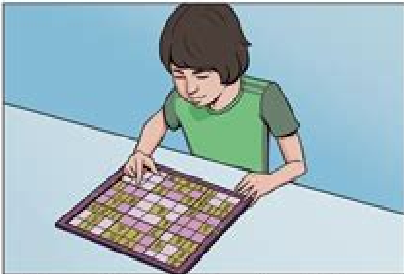
Concrete Operational Stage ( ages 7-12 )