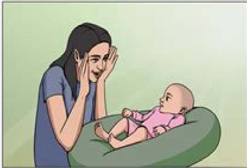
Sensory-Motor Stage ( Birth-age 2 )