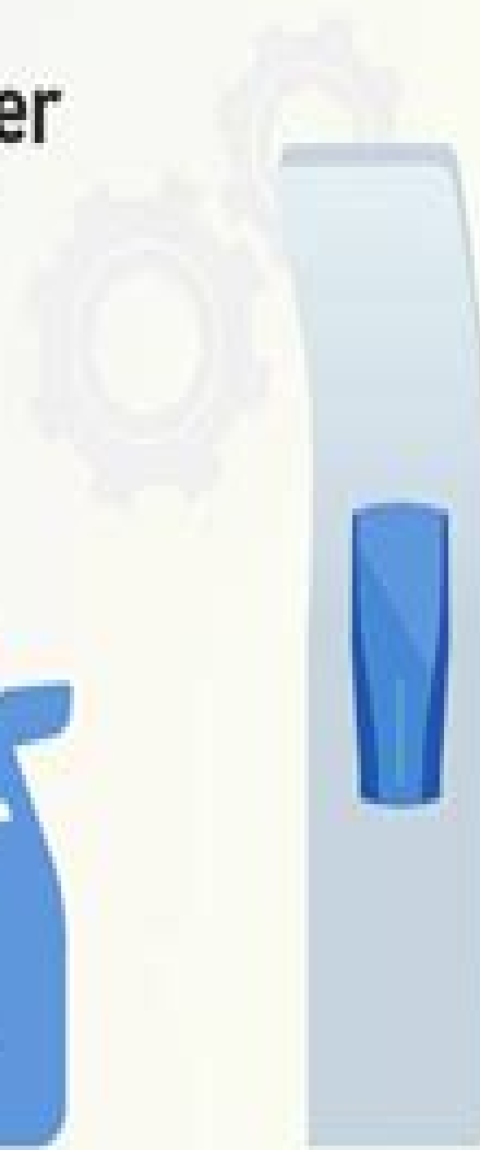
AC EV Charger