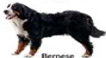
Bernese Mountain Dog