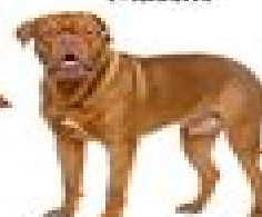
Dogue de Bordeaux