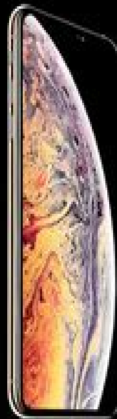
iPhone Xs Max